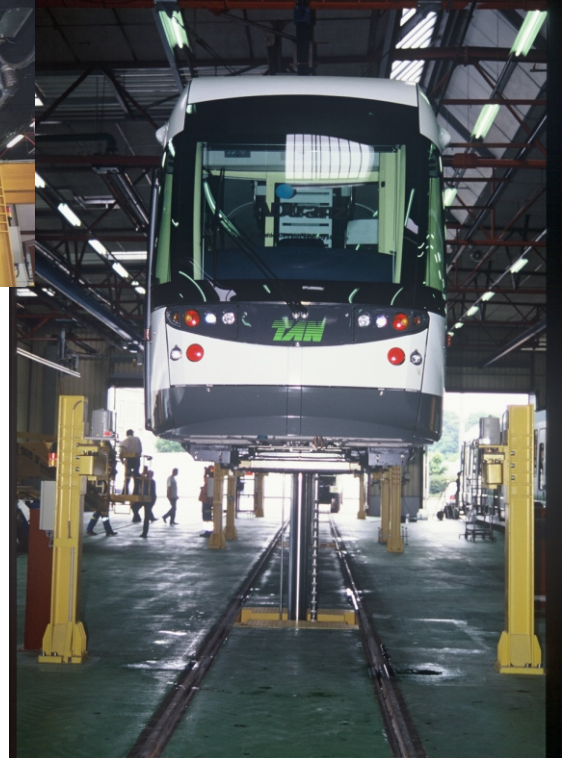
TAN Nantes, France