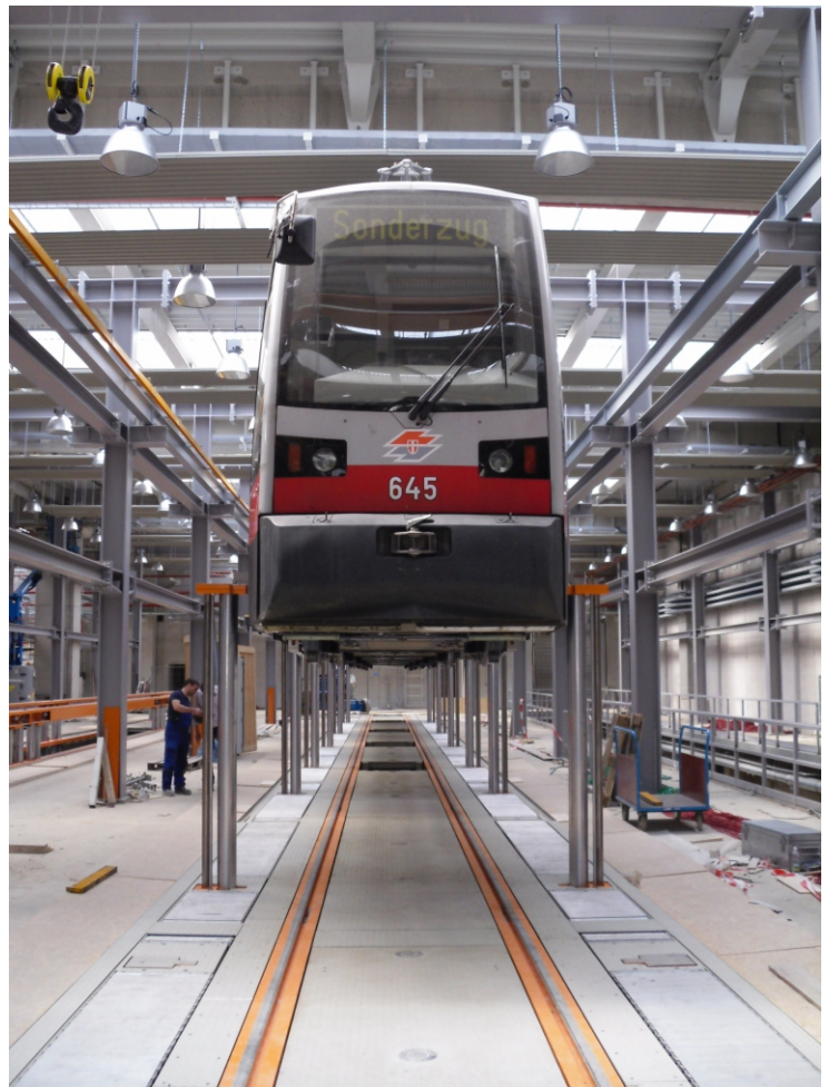
Hauptwerkstätte Simmering, Wiener Linien, Vienna-Austria