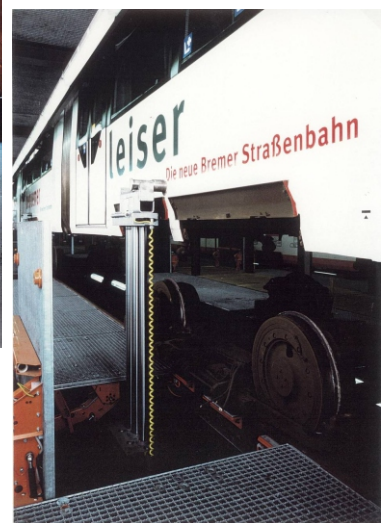
BSAG Bremer Strassenbahn AG Germany