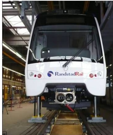
RET Rotterdam, Netherlands