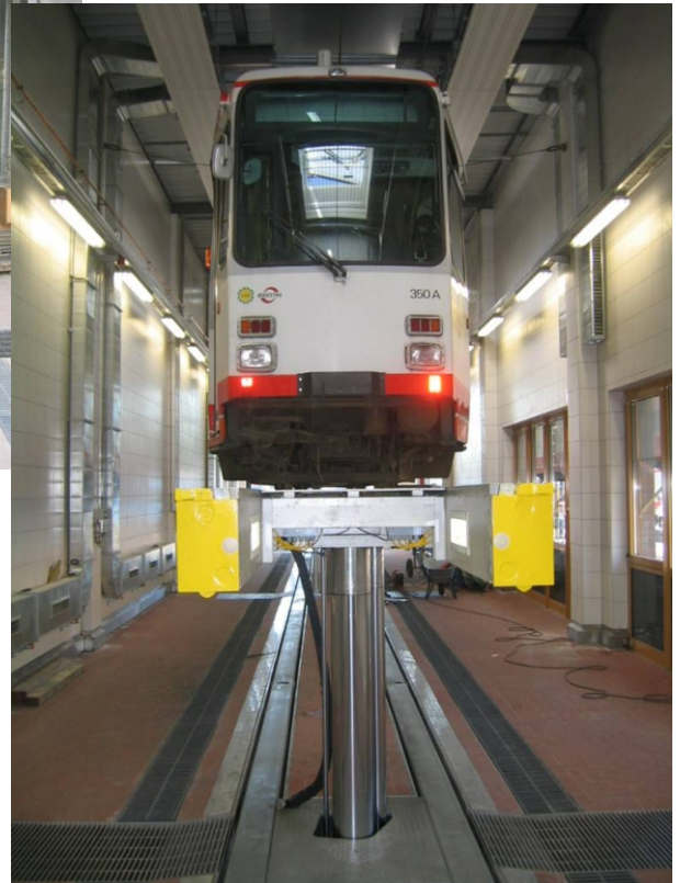
Bogestra Bochum-Gelsenkirchen Strassenbahn AG- Germany